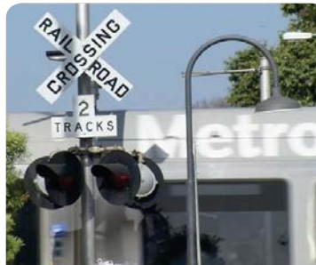
The all familiar “crossbuck” will be a staple at all our street level crossings. This universal sign is used the same as a yield sign and motorists must yield at the grade crossing if a train is approaching.