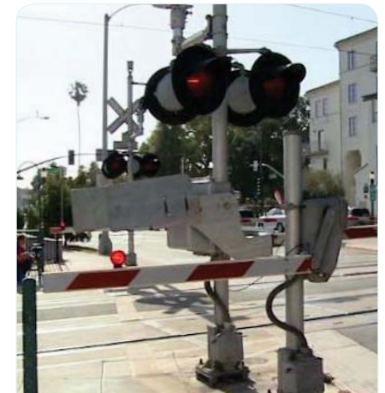
Pedestrian gate arms are lowered simultaneously with the quadrant gate arms along the street when a train is approaching. This combination of arms will stop all traffic from crossing the tracks including pedestrians and cyclists.

Check out the Designing Safe Grade Crossings video on www.foothillgoldline.org/news/videos