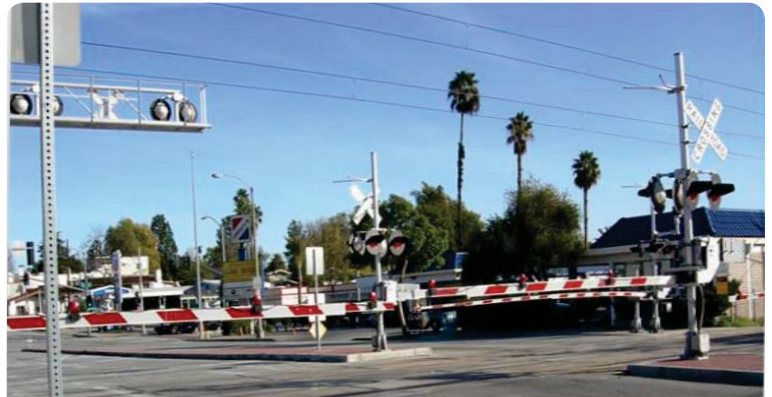
Photo of a four-quadrant gate crossing. Four gate crossing arms will span over all lanes of traffic to prevent vehicles from sneaking around the gates when the arms are lowered and not waiting for a train to pass before entering the crossing.

Want to learn more about the safety features designed for the street level crossings? The Construction Authority has put together an informative video about the history, design and engineering incorporated into each of the street-level crossings along this project that can be found online at www.foothillgoldline.org/news/videos and by clicking on the Designing Safe Crossings Video at the bottom of the page.