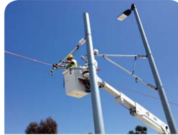
Mass Electric Construction Company crews installing the messenger wire atop Overhead Catenary System cantilevers and poles.

The OCS installation is also underway, which is how power is supplied to the light rail trains. The OCS system consists of OCS poles and cantilevers, aerial messenger and contact wires, and the installation of ten Traction Power Substations (with a substation installed generally every 1 to 1½-miles from one another). The OCS installation is being managed and performed by Kiewit’s subsidiary Mass Electric Construction Company, a recognized leader in transit and rail systems installation.