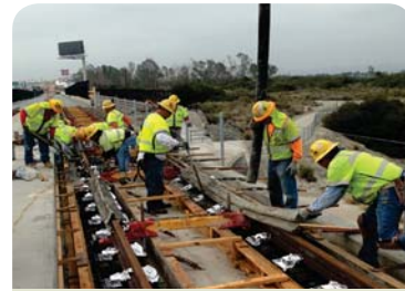
At the San Gabriel River Bridge in Irwindale, the track is directly fixed to the concrete foundations. This eliminates the need for concrete rail ties and ballast rock, considerably reducing the overall weight on this 700-linear foot bridge.