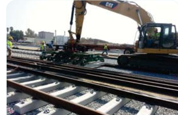
This tie handling machine referred to as a “Tie Dragon” places the 600 lbs. concrete rail ties – six at a time – making for a quicker and accurate installation.