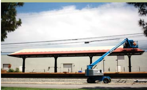
Approximately 50% of each light rail platform will be covered by a canopy. Here, crews are installing the roof of the canopy at the Duarte / City of Hope station.