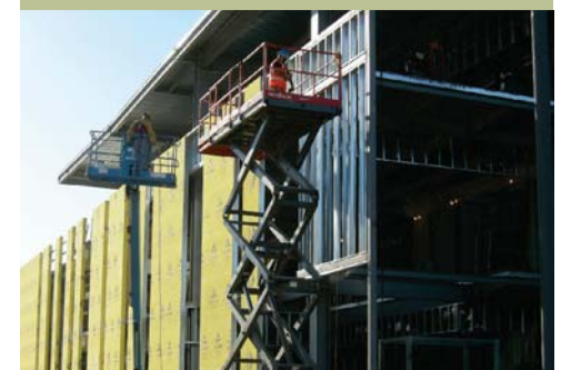
The three-story main shop building will house administrative offices and facilities for the future train operators in the upper levels, and a full service shop on the ground floor.