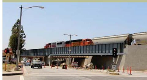
In June 2014, track crews successfully cut-over the active freight train service to the last section of relocated freight tracks shown here over the newly built freight bridge above Foothill Blvd in Azusa.